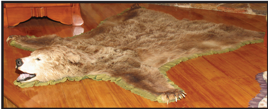
The silver-tipped grizzly bear that Brother Branham shot

So I put a shell up in the barrel of the gun. And we was down under this little coulee. Just as I raised up, here he come. My, my. I stopped, shot, and it sounded like a pea-shooter hitting him. Boy, it never a bit more checked him up than nothing. And my, before... You talk about speed—I never seen anything like that. They’d outrun a horse, or deer, or anything, you know a bear can, like that. Him coming down that hill right towards us, like that. Before I could get another shell in the gun he dropped dead about, oh, about 30, 40 yards from me—just turned end over end. Took heart, lungs, and all from him. It was a nozzler bullet, you hand-loaders know. So it blowed him up, and he fell over.